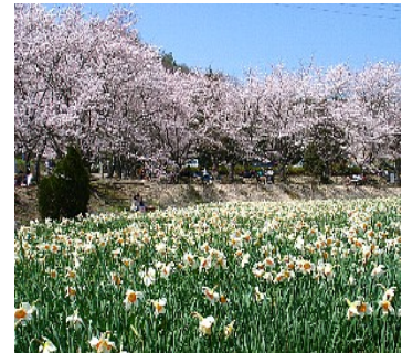
Cherry blossoms at Ikoinomura Harima

Worldwide environmental problems, such as global warming and the destruction of the ozone layer, are threatening the survival of the human race. We must build a sustainable society through technological advancement and social endeavors. I believe that the business community must harness its technologies and know-how for society and develop business from a global perspective.