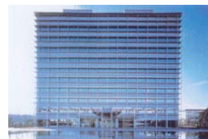
Takuma Head office